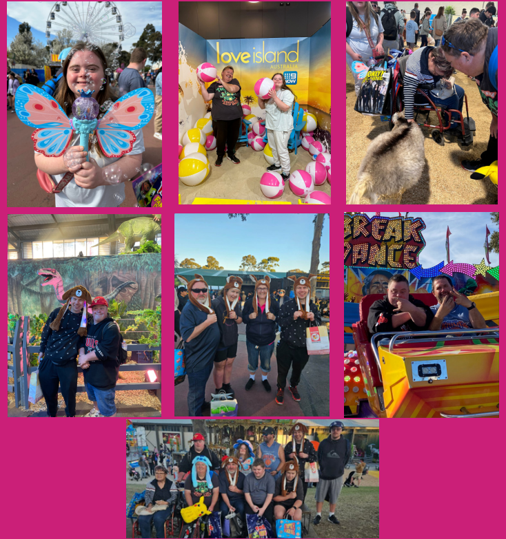
Participants and staff had a ball on a weekend trip away to attend the Royal Melbourne Show.