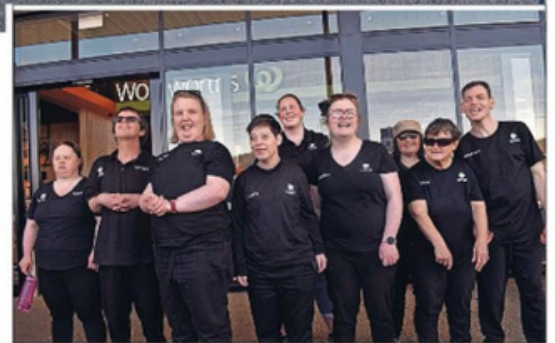
Flash mob: Vivid dance crew members.

The team at Vivid would like to thank the crowd who enjoyed the show along with Echuca West Woolworths, which kindly provided the space for the performance.