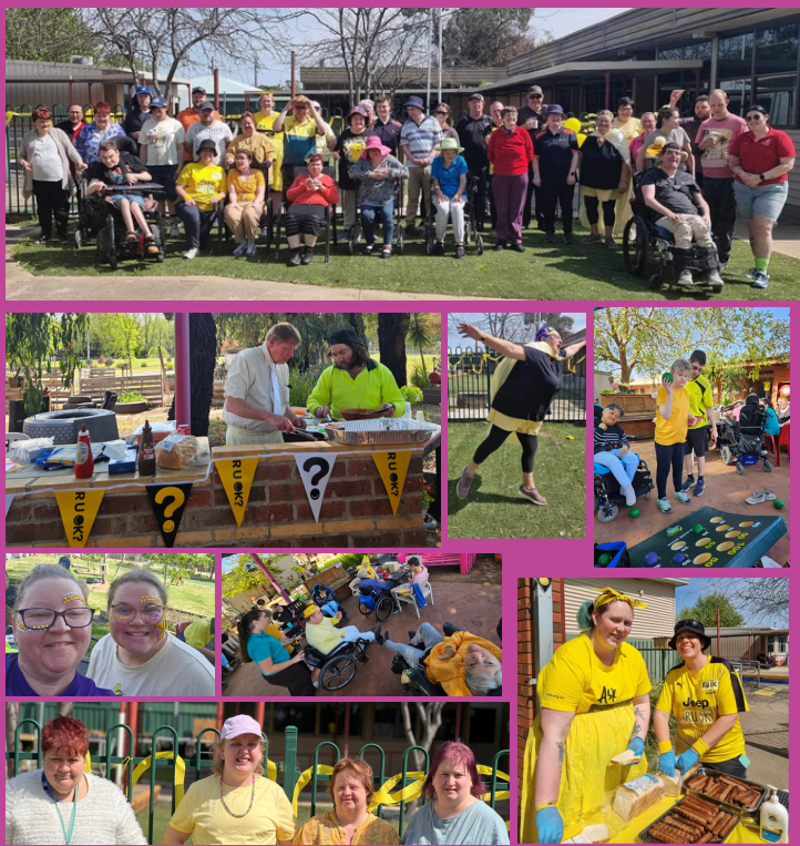
R U OK? Day was celebrated at Vivid Living in Echuca and Swan Hill.