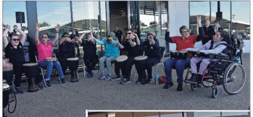
We are Vivid: Vivid's performing arts group from the culture and art day program.

"Program choices are structured around key themes — culture and arts, communication and technology, healthy living, adventure and recreation, work skills and life skills."